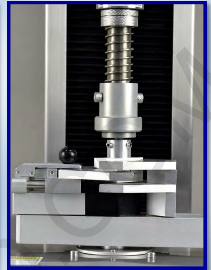
Quick clamping system