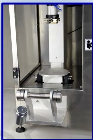
Calibration pack (Optional)