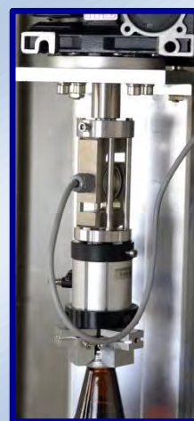
Dynamometric system (Optional)