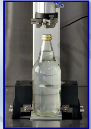
Automated Clamping system & Customized clamps