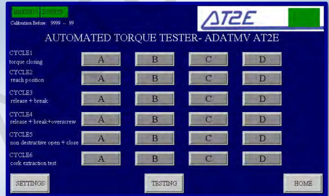
6 cycles available – satisfy various of products test request