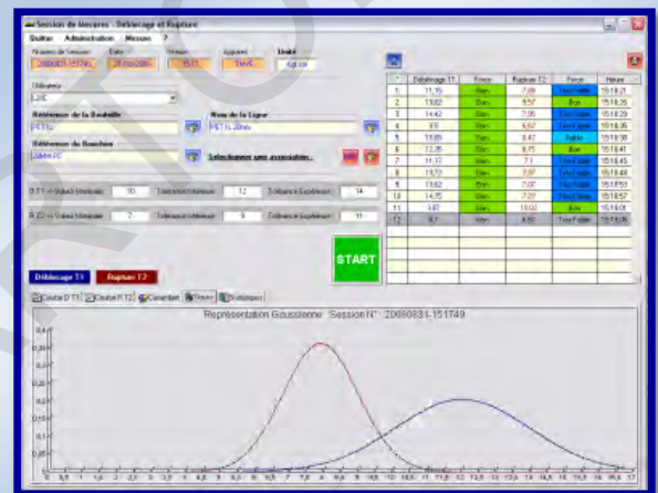
“QUALITORQ” Software (Optional)