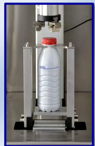
Automatic squeezing clamping system for PET packaging (Optional)