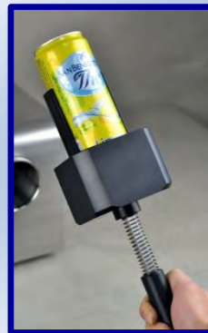
Custom-made handle for smaller size of can