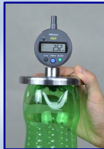
Applicable for various sizes of bottles