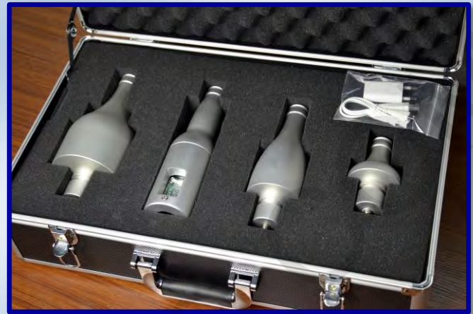
BT ETA TORQUE Pack Single sensor for different bottle format replacing