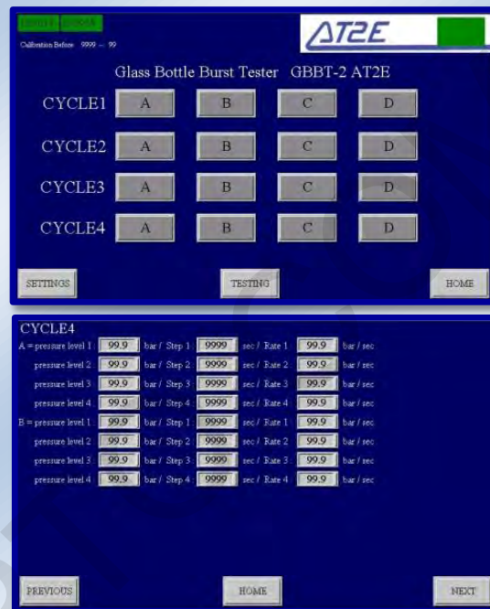
Cycle setting screen

The GBBT-2 is an instrument for testing the internal pressure resistance of glass containers. It has been widely used by the glass container manufacturers and users. As a standard testing instrument for the glass container industry, it offers an important technical reference to the manufacturers for maintaining or improving the product quality and performance.