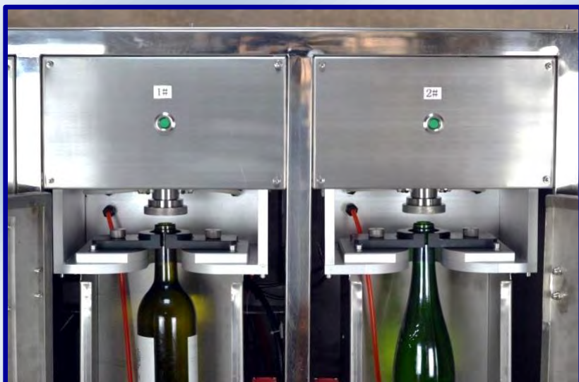
Efficient dual station design