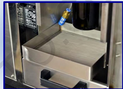
Trash bin design with silencing sifter