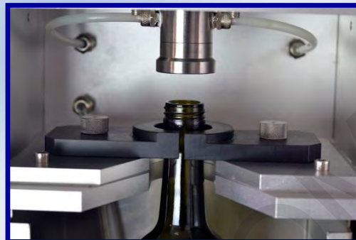
Auto filling & clamping system