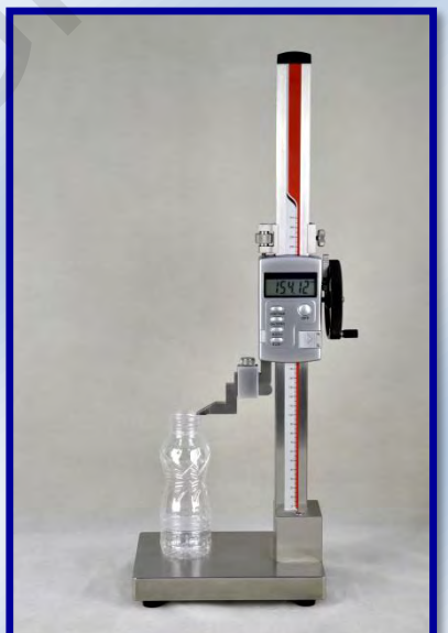
PET Bottle Measuring