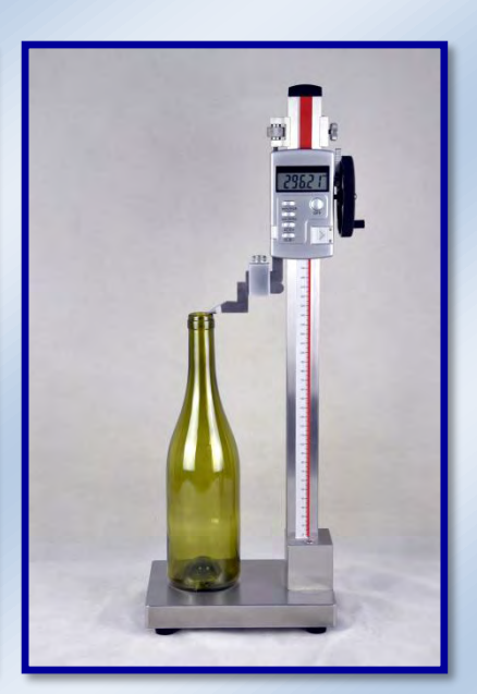
Glass Bottle Measuring