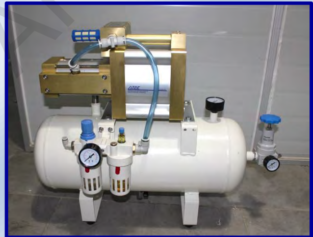
Additional booster (Optional)