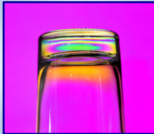
View by PL-G