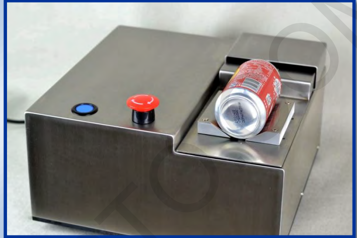
SS-1 Seaming Cutting Saw