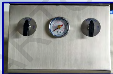
Control valve and analog display

AT2E SSA-ECO secure seal analyzer is for testing the secure seal performance of products. With AT2E patent needle, it makes the installation and piercing very quick and easy in any medium. By vacuum technology and special design, the needle uses a function of self-holding on the tested products. However, the SSA-ECO can be compatible with using the needle of the classic Secure Seal Tester (typical screwed needle). It's stainless steel design makes it resistant of any explosion during the test and ensures the safety of the operator.