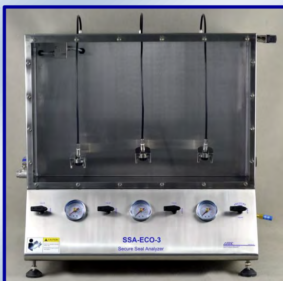
Optional 3 position model: SSA-ECO-3