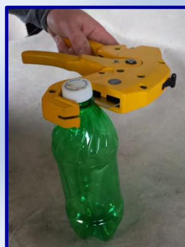
Quick cutting tool