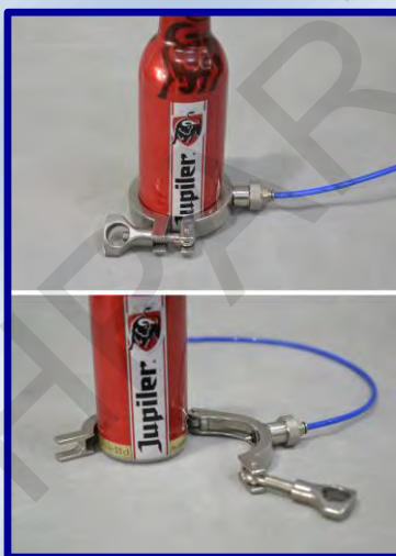
Bottle Can Needle