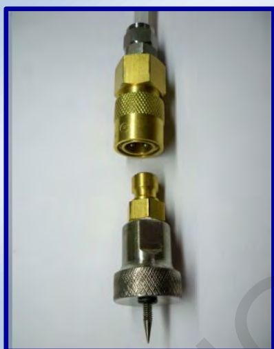
Typical screwed needle