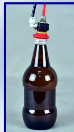
AT2E patent needle