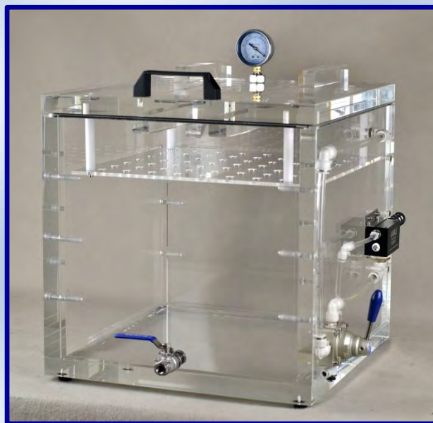
VLT-ECO with immersion system