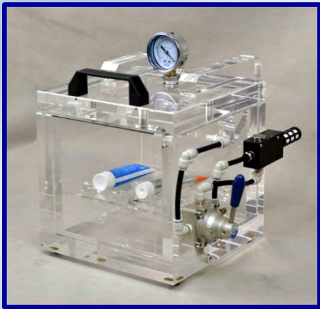
With Vacuum Generator