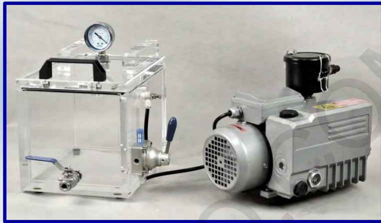
With Vacuum pump