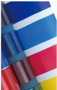
Ink & Printing

It is widely used in ink, printing, film processing, textile dyeing, plastic electronics and other industries for accurate color measurement and quality control, as well as in scientific research institutions, quality testing institutions, laboratories; especially suitable for precise measurement and quality control of optical density and dot enlargement in ink printing.