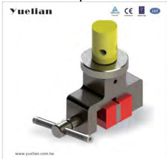
YG-T003D plane clamp