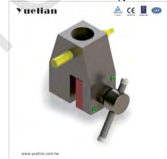
YG-T001 flat clip