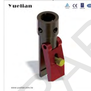
YG-T005 beak clip