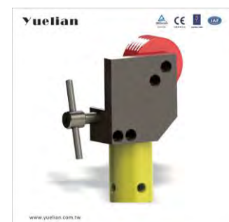
YG-D007 line fixture