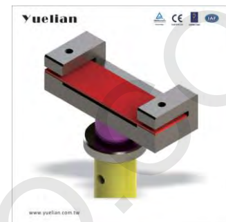
YG-T104 tack ring fixture