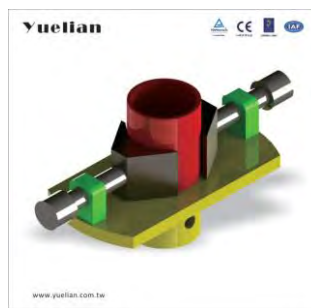
YG-C003A puncture clamp