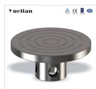
YG-C004C compression plate