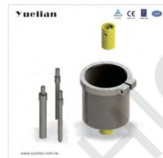
YG-C003 film puncture