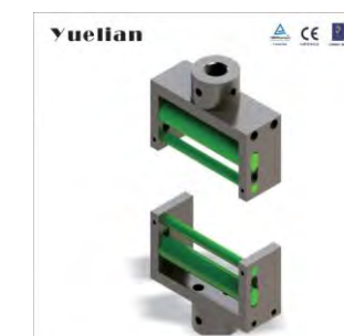
YG-T006 webbing clamp