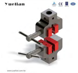
YG-T003A plane cloth clamp