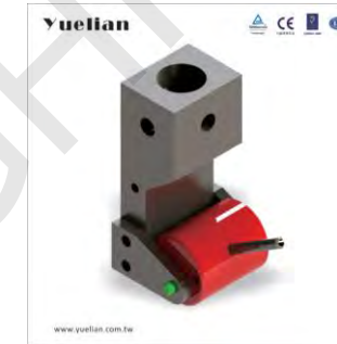
YG-T007 eccentric clamp