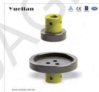
YG-C005 bottle compression fixture