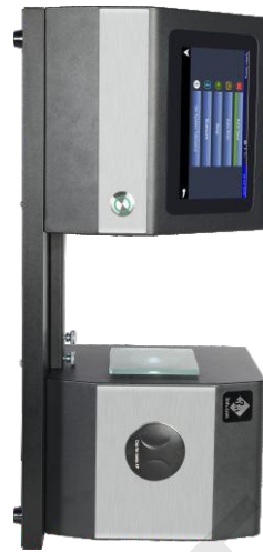
Vertical haze measurement