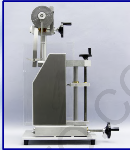
GBIT with Safety frame (Optional)

Special instrument for testing the impact resistance ability of various glass bottles and jars.