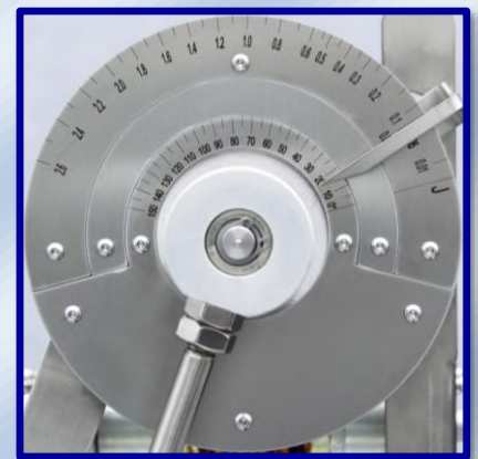
Standard Energy scale

Sample dia. range: \Phi 30-130 mm (clamps for other range available) Impact height: 5 - 305 mm (5 - 200 mm when impact point in bottom of bottle, other range by order) Max. impact energy: 2.6 J Resolution: 0.1J for each lattice (when impact energy larger than 0.6J) 0.05J for each lattice (when impact energy less than 0.6J) Energy loss: \leq 1.5\%FS Dimensions: 580 mm * 350 mm * 850 mm