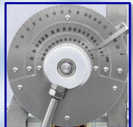
With additional impact speed scale (optional)